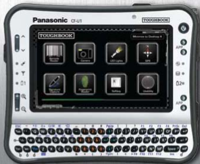
TOUGHBOOK U1 ULTRA

*Screen image is for demonstration purposes only.