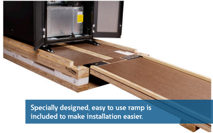
Specially designed, easy to use ramp is included to make installation easier.

BladeUPS Preassembled Systems are priced less than when ordering the standard system components and on-site installation service separately. When you order a preassembled unit you can save 7% on the overall cost of the product. Even more, since the preassembled unit is shipped on a single pallet, you can save up to 20% on shipping costs!