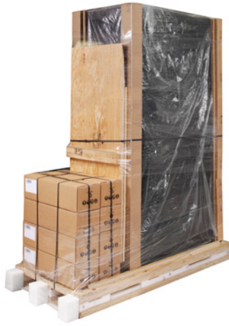
Preassembled System ready for shipment