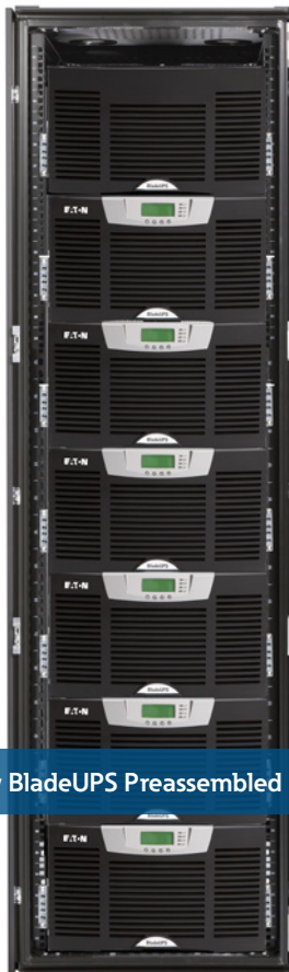
Top Entry BladeUPS Preassembled System