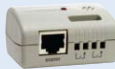
Environmental Monitoring Probe

Gather information from relay contact devices. Provides a dry-contact interface between the UPS and any relay-connected device, including the IBM® eServer iSeries and a variety of industrial applications.