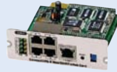
ConnectUPS Web/SNMP Card

The standard unit is equipped with USB and RS-232 serial ports to communicate with power management software. You can customize your UPS by adding an interface card for other applications: