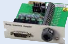
Relay Interface Card

Interwork with your existing Building Management System. A Modbus® Card enables real-time monitoring of UPS systems through a building management system or industrial automation system.