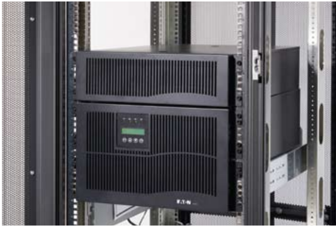
The 9140 and one EBM occupy only 9U of rack space.