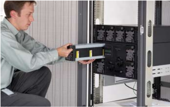
Modular, lightweight design allows for easy installation and service.